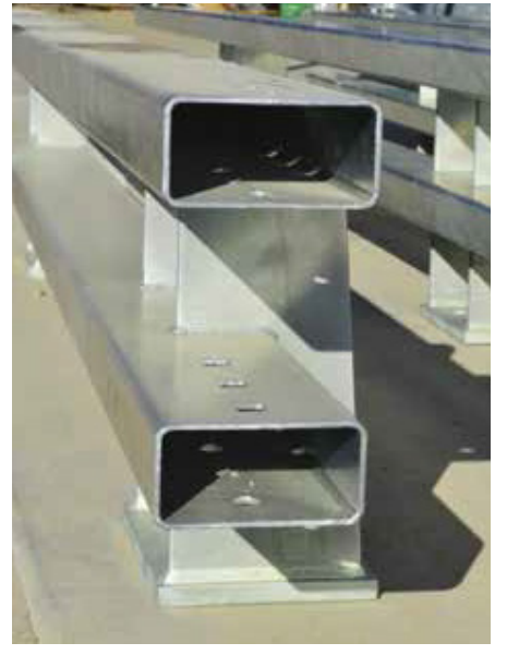
Figure 1: With a specified minimum HDG coating thickness of 85\mu m, AS/NZS 2312.2 can be used to estimate this bridge rail will be protected from rust for over 50 years in a C3 (medium) environment.

† Hot dip galvanized coatings thicker than 85μm are not specified in AS/NZS 4680, however in conjunction with the galvanizer, a specification can be written for thicker coatings.